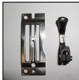
Sewing parts for 53700BZ4031:

Same as 53700BZ4031A, but with guides for filler cord from the top and / or from below for sealing the needle punctures.