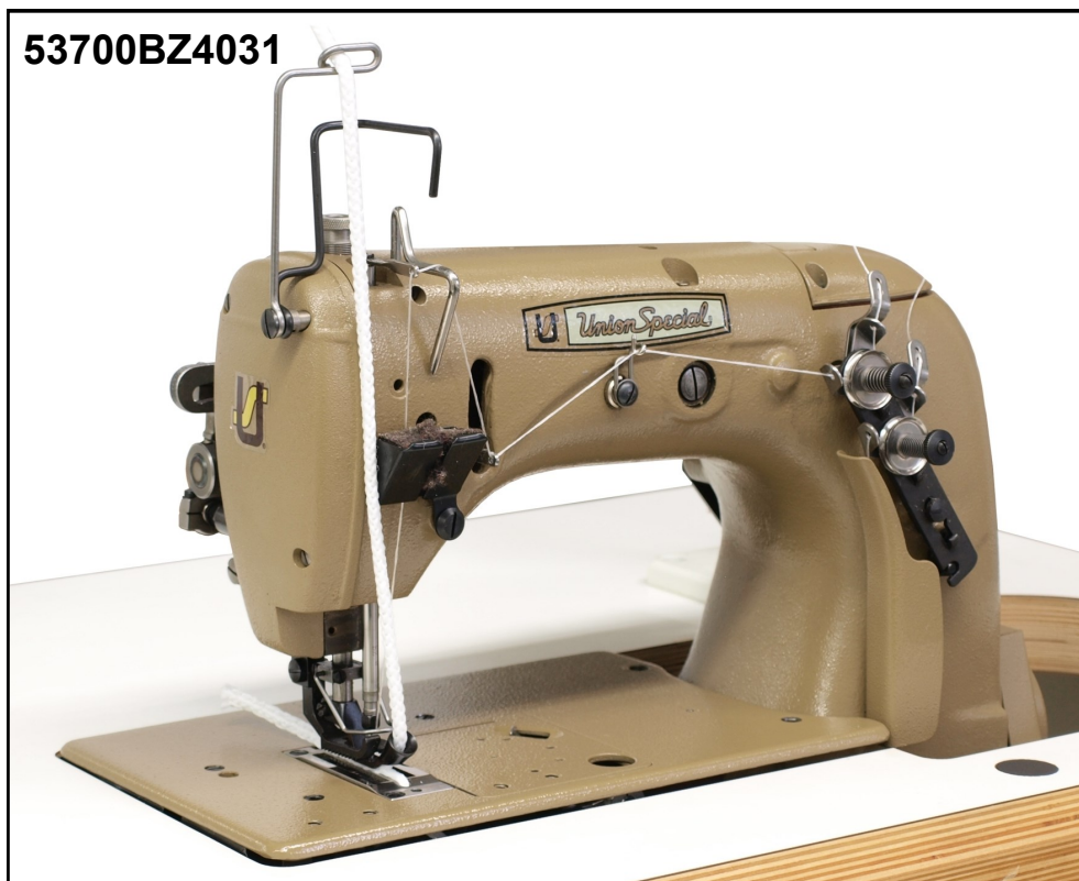
Stitch Type 401